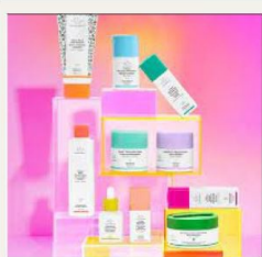
Skincare & Makeup