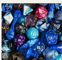
Dungeons & Dragons