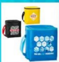
Cooler Bag $6.00