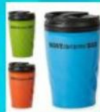
Stainless Steel Thermal Travel Mug $7.00