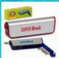
Screwdriver Light Set $6.00