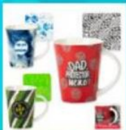
Dad's Mug & Coaster Set $6.00