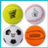
Anti Stress Ball $3.00