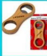
Bamboo Bottle Opener $6.00