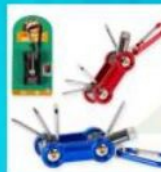
5 in 1 Folding Tool Set $6.00