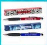
Metallic Stylus Pen $3.00