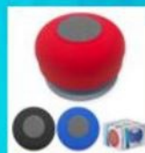
Bluetooth Waterproof Speaker $8.00