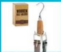
Wooden Belt Holder $6.00