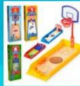
Desktop Game $5.00