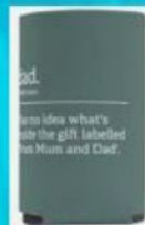
Stubby Holder $6.00 'dad (noun) - Has no idea what's inside the gift labelled'