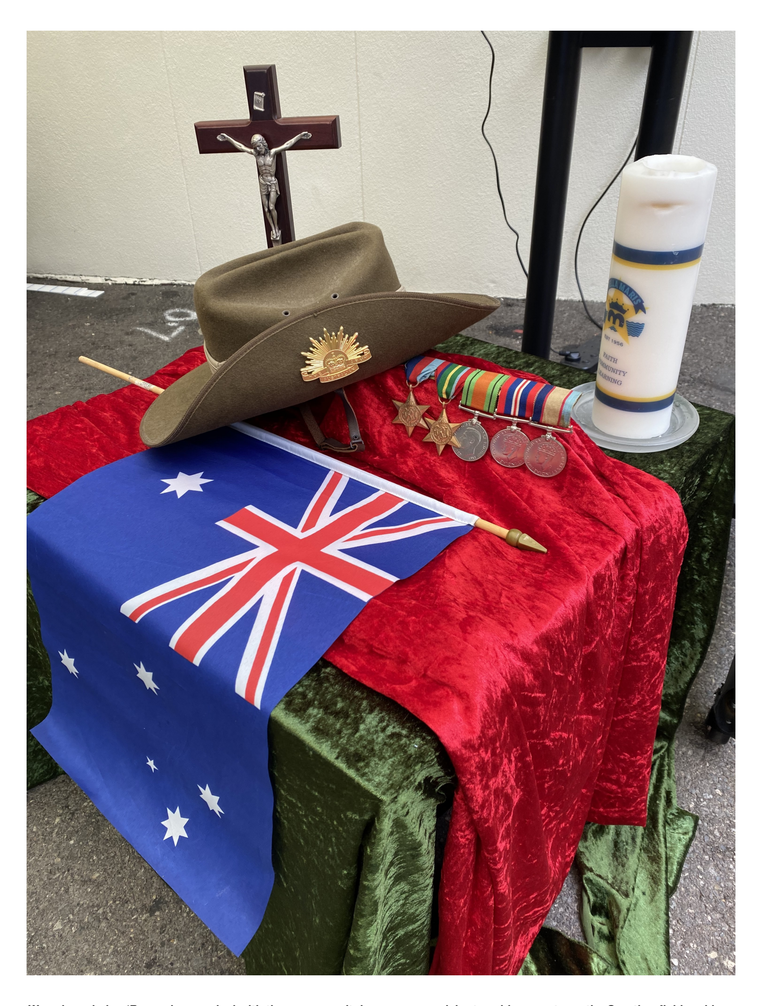
We acknowledge 'Remembrance day' with the reverence it deserves, we celebrate achievements on the Sporting field and in the Arts, we look forward to further whole school events, we prepare for the Boarders to open and we continue some important 2022 planning.